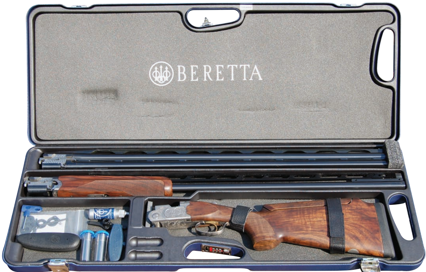
The whole enchilada! The 687 Unsinglet Trap Combo and all its goodies came in an ABS case.

To learn more about Berettas in general, I spent the better part of a day at Beretta USA's headquarters in Accokeek, Maryland, about 40 minutes